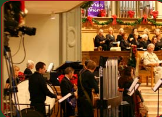
FBC members and guest musicians play in the Christmas Orchestra.