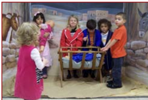
Preschoolers act out the Nativity scene