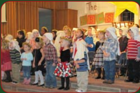
The 3 and 4 year old classes of the CDC present their Christmas program entitled The ABC's of Christmas .