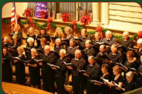
The Sanctuary Choir and Orchestra present Agnus Dei on December 11.