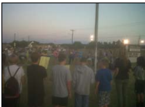
Glenn Middle School See You At The Pole