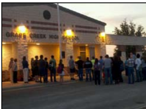
Grape Creek High School See You At The Pole