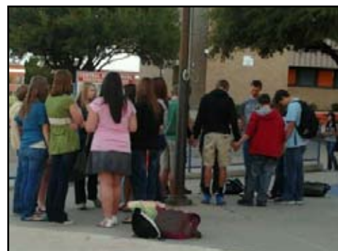
Central Freshman Campus See You At The Pole