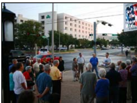
First Baptist Church See You At The Red Doors